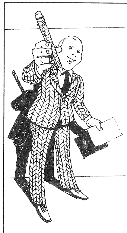
Diagrams can be scanned and added to your wordprocessing document

Ring the Help Desk for more information on image scanning on 365 4116.